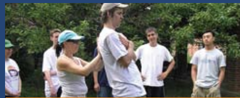
Train the Trainer