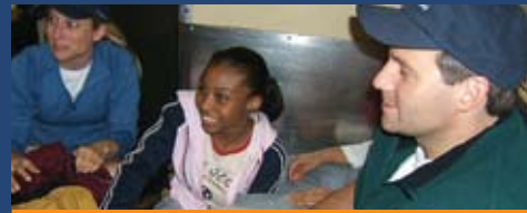
Paired Youth Adult Courses